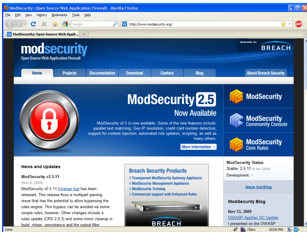
Figure 2-1. The homepage of www.modsecurity.org